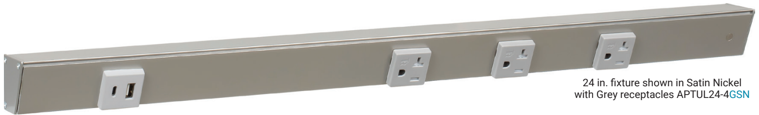
24 in. fixture shown in Satin Nickel with Grey receptacles APTUL24-4GSN

Slim Profile Angle Power Strip fixtures with USB included give your projects a unique modern feature while providing an easy place to charge devices. The included USB-A/C device includes one USB-A port and one USB-C port and supports regular and fast charging. Slim Profile Angled Power Strip fixtures are easy to conceal under cabinets, hiding power out of sight and preserving the beauty of your backsplash. Available in Black, Bronze, Satin Nickel, and White finish options to coordinate with design elements in any space.